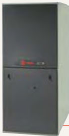
XV95 Furnace With Variable-Speed Motor and Comfort-R™

As part of our continuous product improvement, Trane reserves the right to change specifications and design without notice.